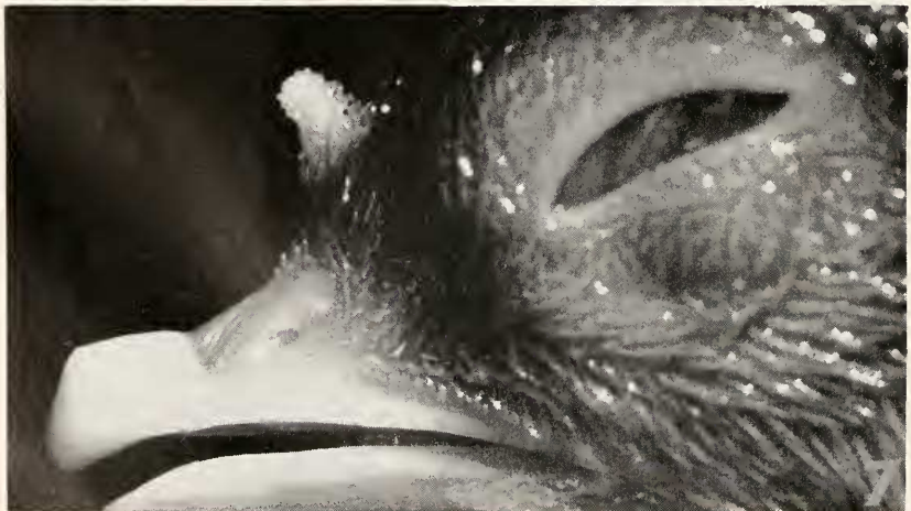
FIGURE 5. Snood at 16th day of incubation. FIGURE 6. Snood at 17th day of incubation. FIGURE 7. Snood at 18th day of incubation.